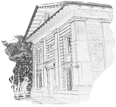
All Saints Old Glossop