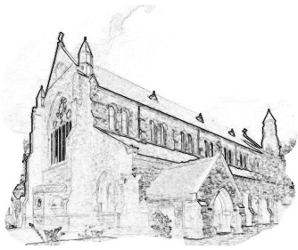
St. Mary Crowned, Glossop 1886